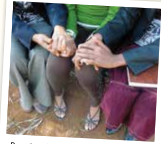
Pray that the government of Eritrea will stop suspecting believers of cooperating with "external enemies" of the state.

May 8 | ERITREA The political situation in Eritrea remains uncertain and tense. Please pray for the believers as the resulting increased surveillance directly affects them. Pray that the government will stop suspecting them of cooperating with "external enemies" of the state.