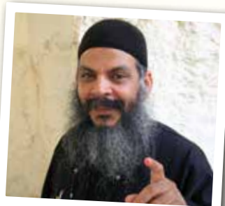
Pray for more opportunities for Open Doors to work with the churches in Egypt.

May 31 | ERITREA Pray for the women who are forced to become bread-winners when their husbands are arrested for their faith. May God give them wisdom, strength and provide innovative opportunities for them to take care of their families. And my God will meet all your needs according to the riches of his glory in Christ Jesus. (Phil. 4:19)